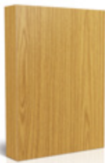
CO Calva Oak