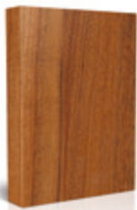
DN Dijon Walnut