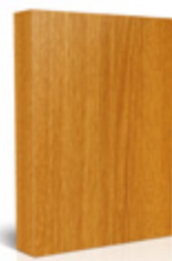
LO Light Oak