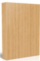
SO Stone Oak