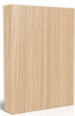
VO Verade Oak