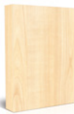
CM Canadian Maple