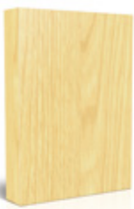
JA Japanese Ash