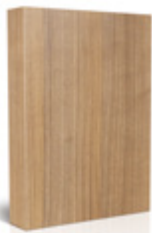
SC Santiago Cherry