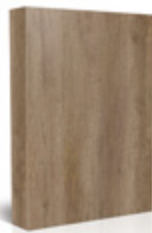
NO Nebraska Oak