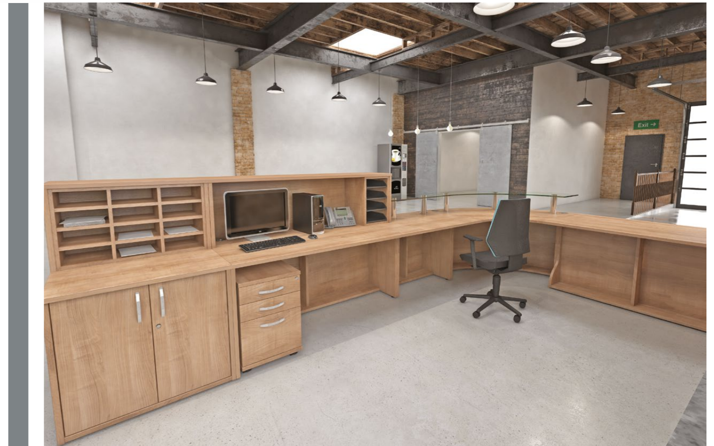
Various storage options are available to complete the range.