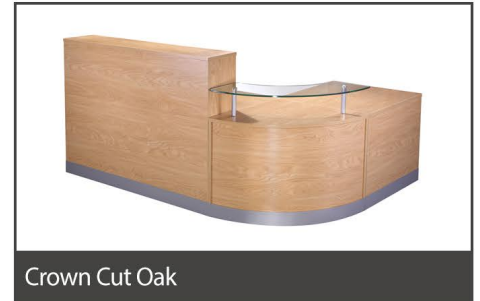
Crown Cut Oak