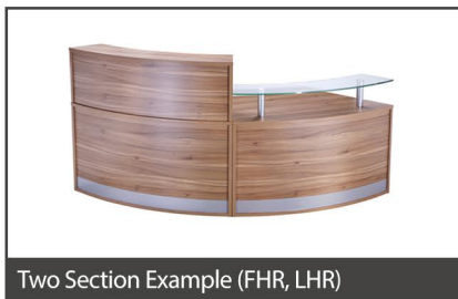
Two Section Example (FHR, LHR)