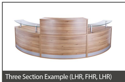
Three Section Example (LHR, FHR, LHR)