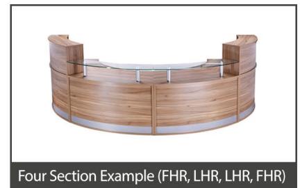
Four Section Example (FHR, LHR, LHR, FHR)