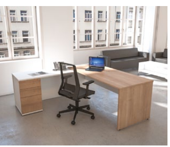
Two tone 1 finish & white return