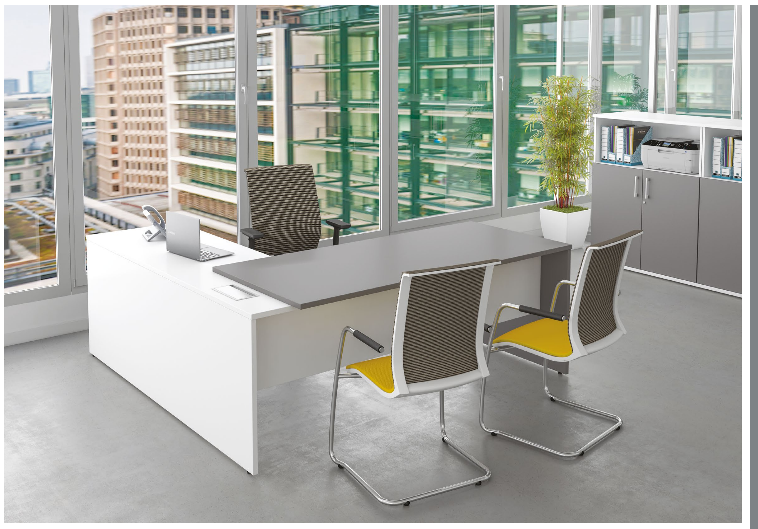
The Fresh seating collection offers modern, stylish seating to complement your new executive workstation.

Executive is available with a single or two toned finish. Choose from a combination of our 17 board finishes to suit your requirements.