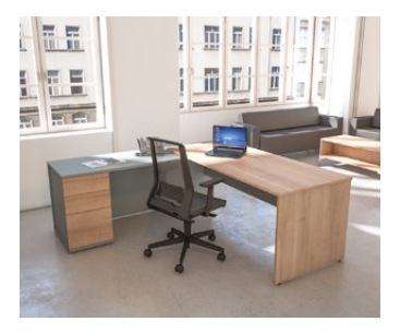
Two tone 1 finish & silver return