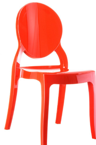
Glossy Red Code: ZA.1165C