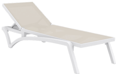
Taupe/White Code: ZA.1395SL