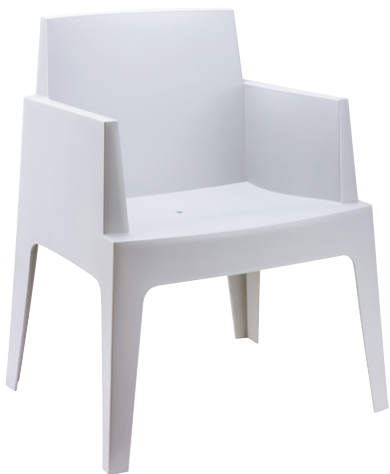
Silver Grey Code: ZA.1264C