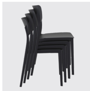
Monna side chair can stack eight high for easy storage