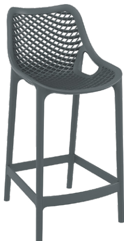
Dark Grey Code: ZA.1198ST