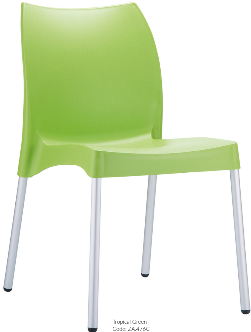
Tropical Green Code: ZA.476C