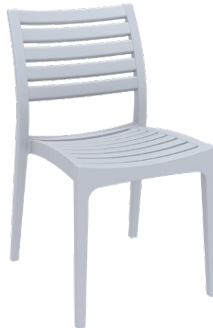
NEW COLOUR - Silver Grey Code: ZA.15131286C