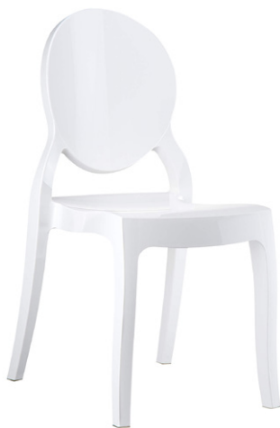
Glossy White Code: ZA.1164C