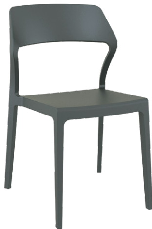
Dark Grey Code: ZA.1102C