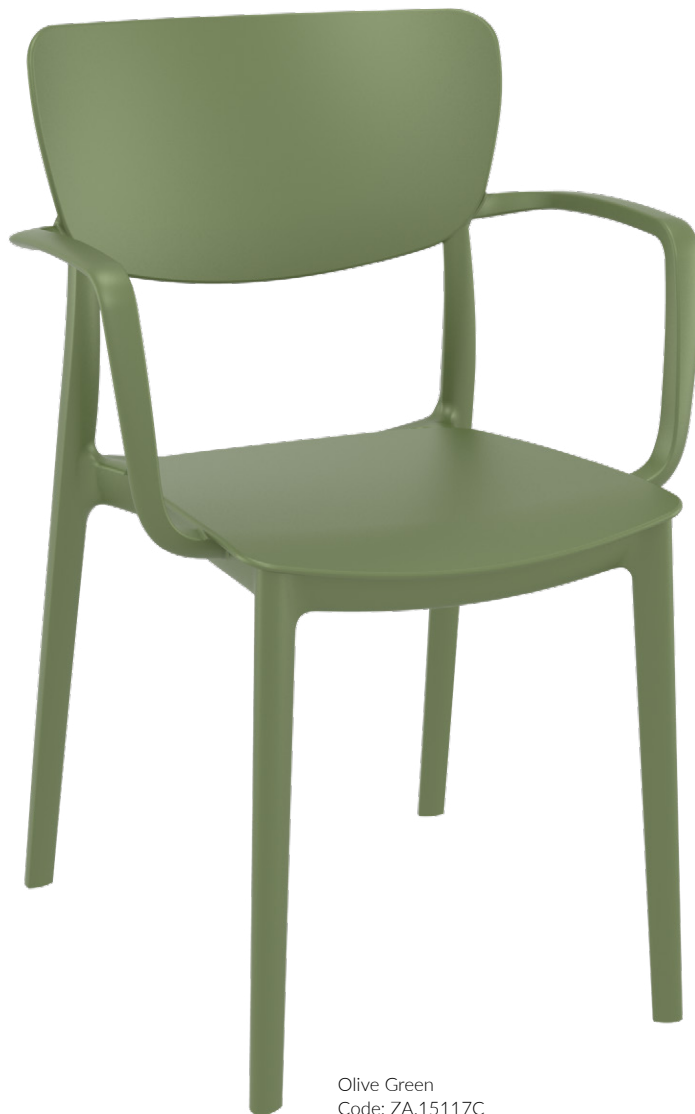
Olive Green Code: ZA.15117C