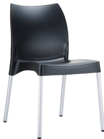
Black Code: ZA.474C