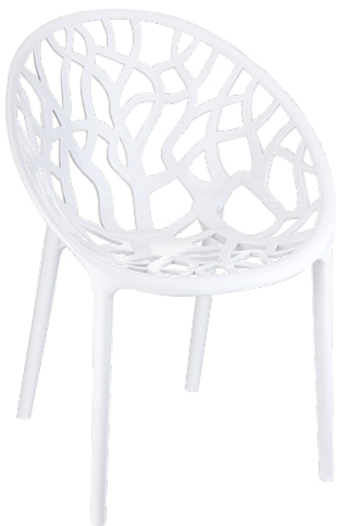
Glossy White Code: ZA.1158C