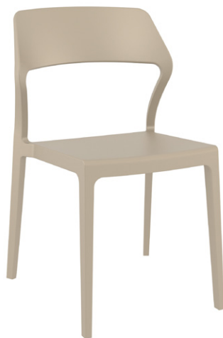
Taupe Code: ZA.1105C