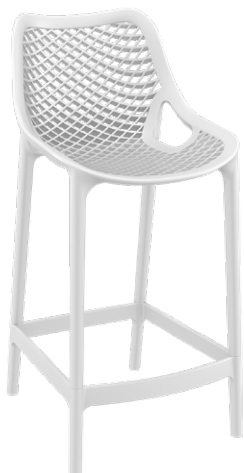
White Code: ZA.1197ST