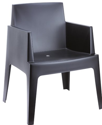
Black Code: ZA.1265C