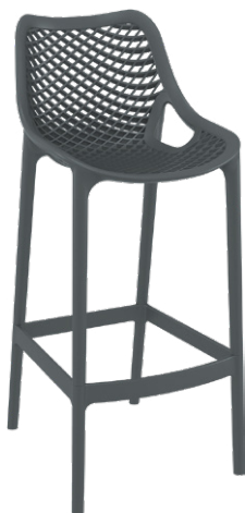
Dark Grey Code: ZA.481ST