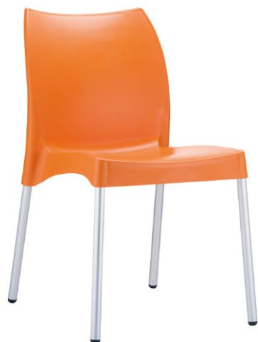
Orange Code: ZA.473C