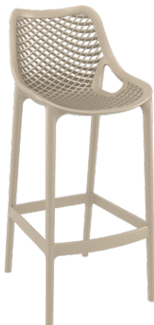
Taupe Code: ZA.1477ST