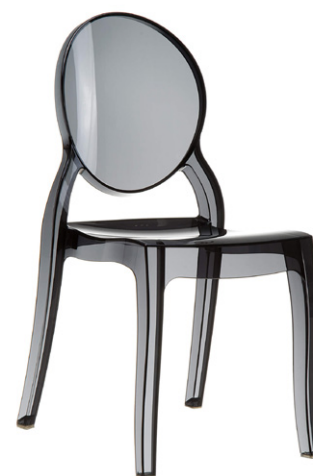
Black Transparent Code: ZA.1169C