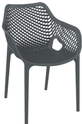
Dark Grey Code: ZA.480C