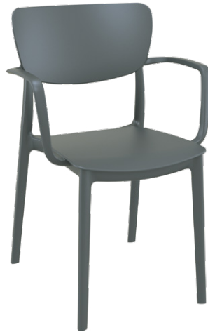
Dark Grey Code: ZA.15118C