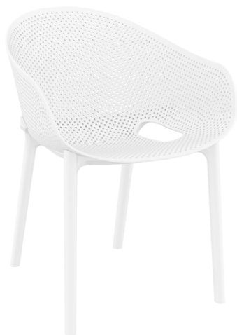
White Code: ZA.72106C