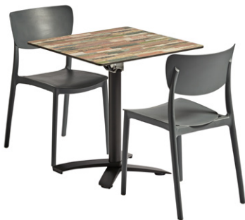
Monna Dining Set Page 561