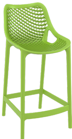
Tropical Green Code: ZA.1202ST