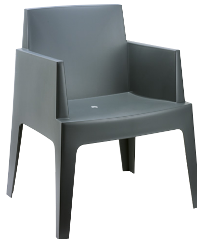
Dark Grey Code: ZA.1263C