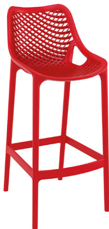
Red Code: ZA.224ST