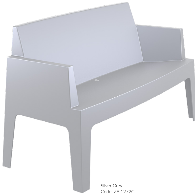
Silver Grey Code: ZA,1272C