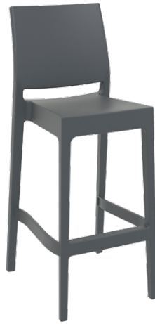
Dark Grey Code: ZA.1108ST