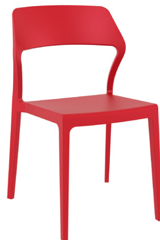
Red Code: ZA.1103C