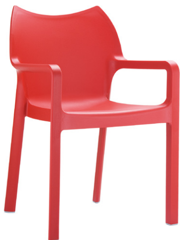
Red Code: ZA.367C