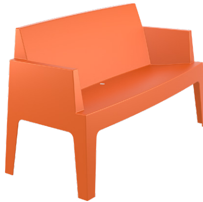
Orange Code: ZA.1269C