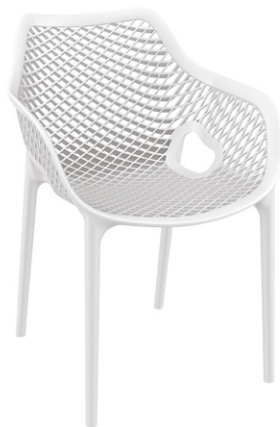
White Code: ZA.219C