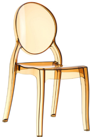
Amber Transparent Code: ZA.1163C