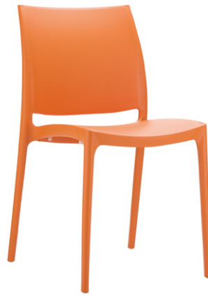
Orange Code: ZA.105C