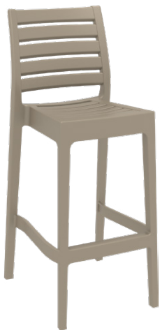
Taupe Code: ZA.15131299ST