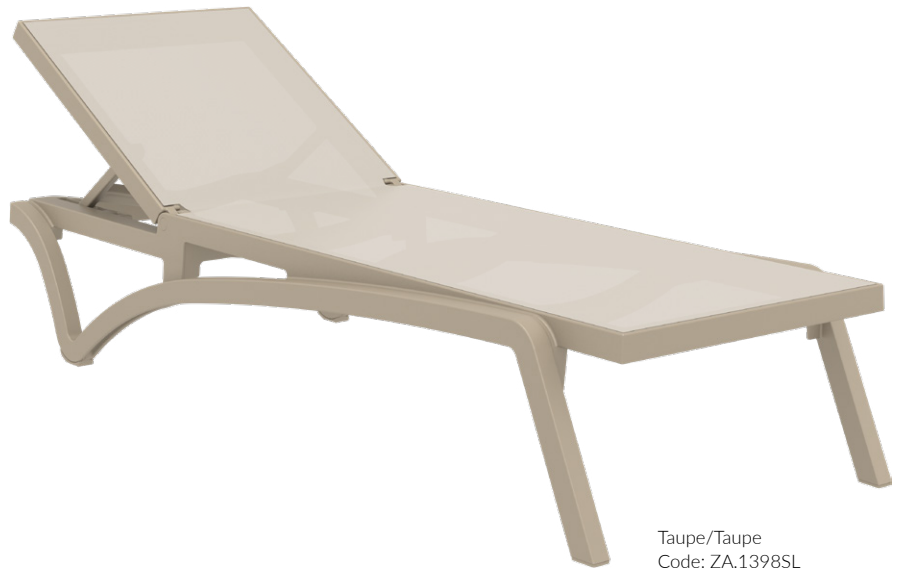
Taupe/Taupe Code: ZA.1398SL