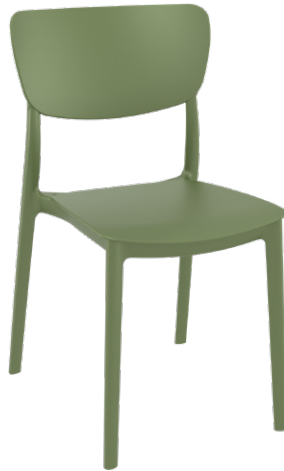
Olive Green Code: ZA.15114C