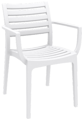
NEW COLOUR - White ZA.15131290C