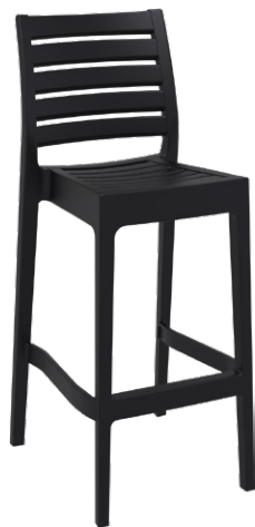
Black Code: ZA.15131298ST