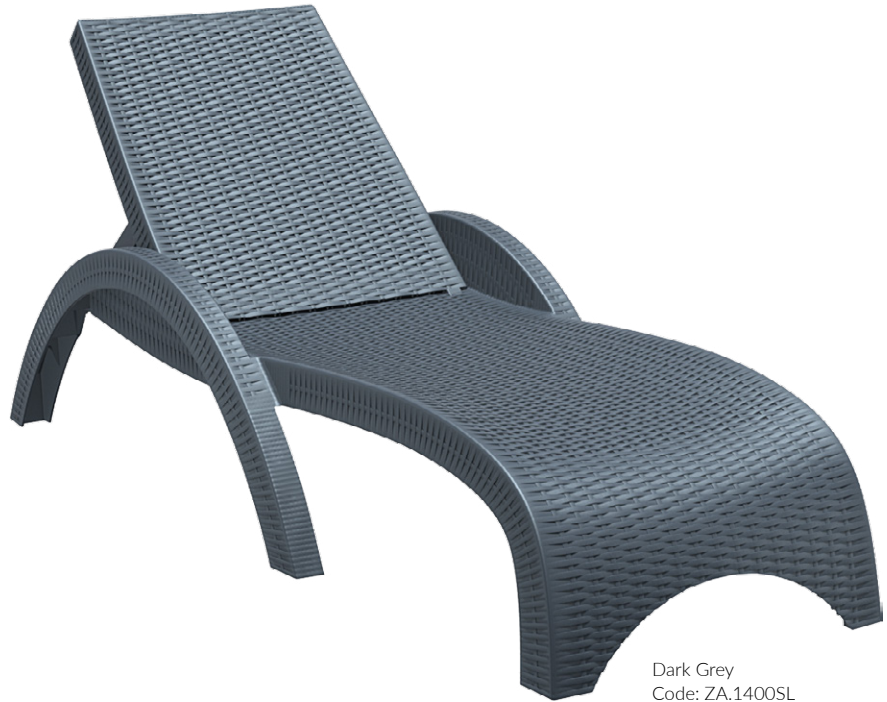
Dark Grey Code: ZA.1400SL