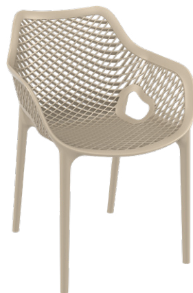
Taupe Code: ZA.1475C