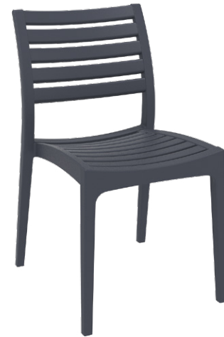
NEW COLOUR - Dark Grey Code: ZA.15131288C