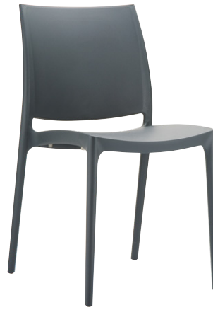
Dark Grey Code: ZA.500C