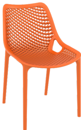
Orange Code: ZA.1472C