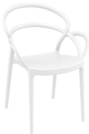
White Code: ZA.1091C