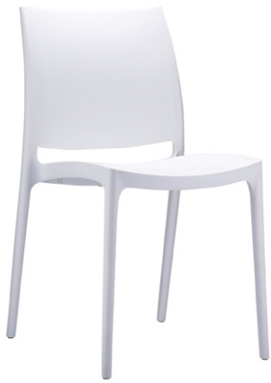
White Code: ZA.103C