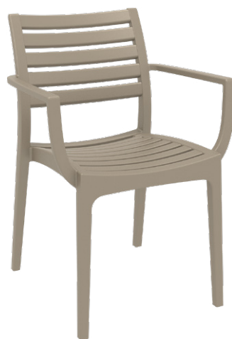
Taupe Code: ZA.1515C