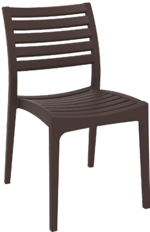
NEW COLOUR - Brown Code: ZA.15131289C