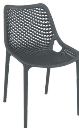
Dark Grey Code: ZA.479C