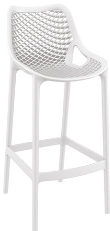
White Code: ZA.223ST