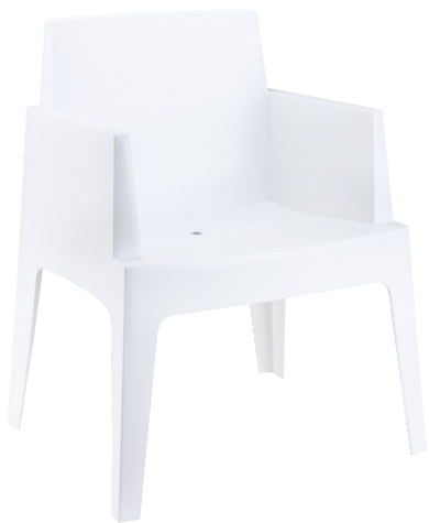
White Code: ZA.1261C