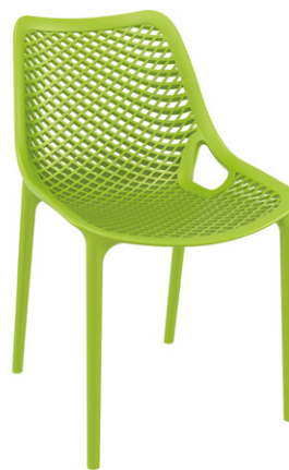
Tropical Green Code: ZA.217C