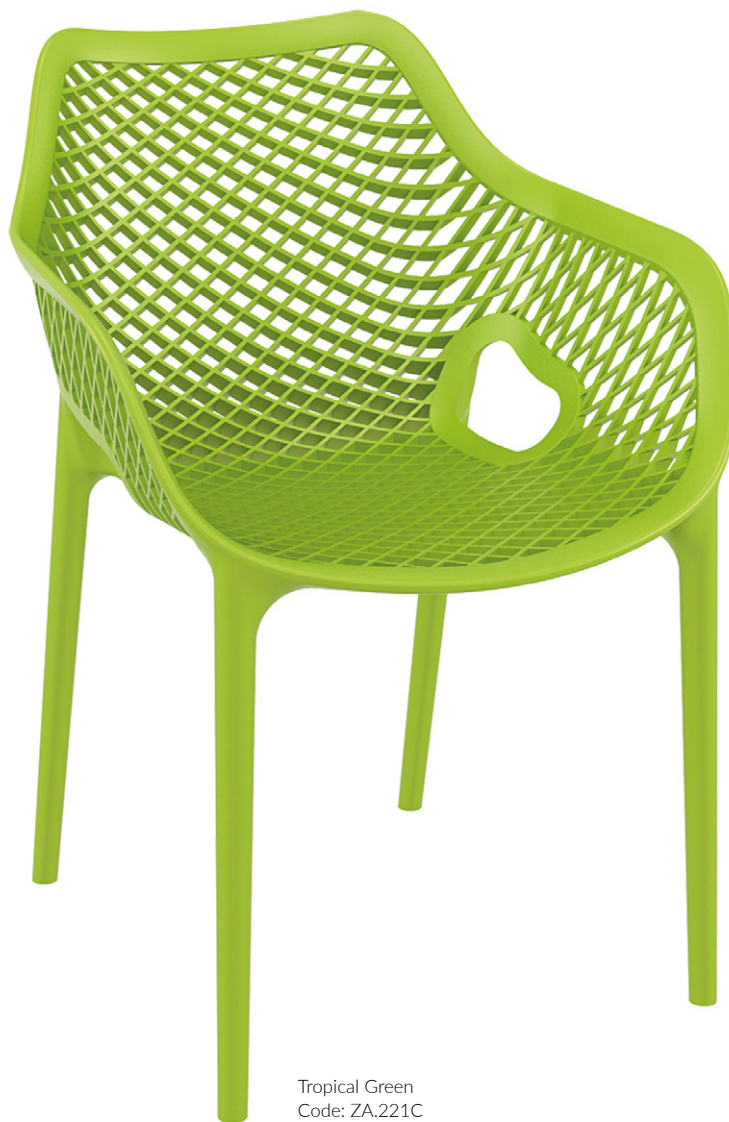
Tropical Green Code: ZA.221C