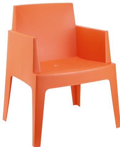
Orange Code: ZA.1262C