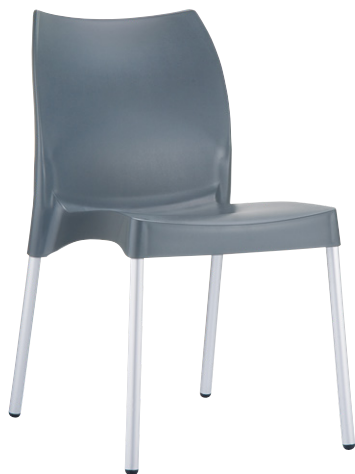
Dark Grey Code: ZA.1479C