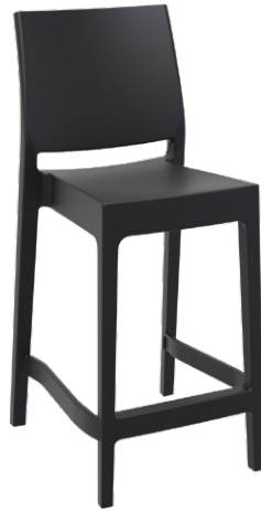
Black Code: ZA.1113ST