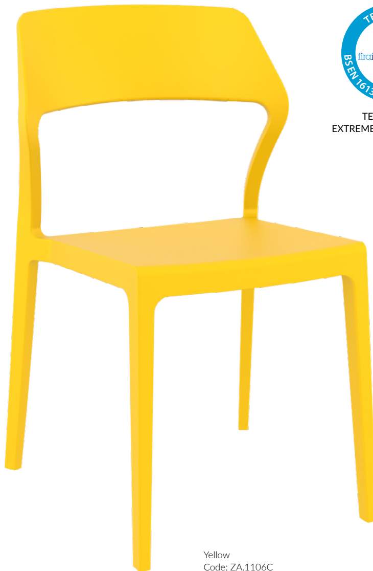
Yellow Code: ZA.1106C