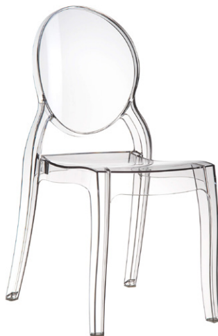
Clear Transparent Code: ZA.1168C