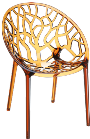
Amber Transparent Code: ZA.1155C