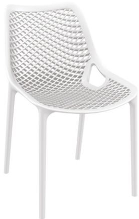
White Code: ZA.215C