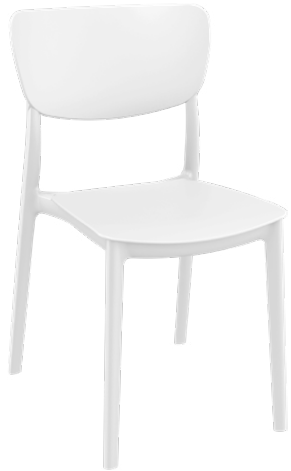
White Code: ZA.15113C