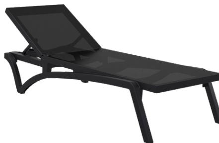
Black/Black Code: ZA.1399SL