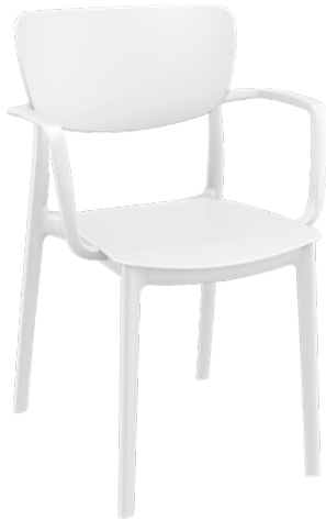
White Code: ZA.15116C