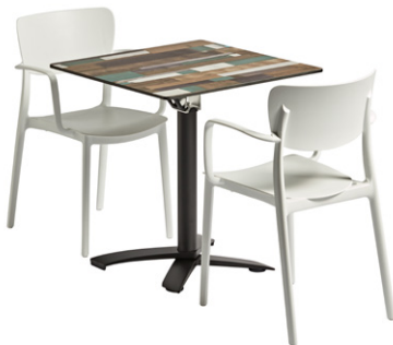
Lisa Dining Set Page 560