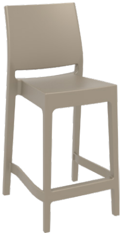
Taupe Code: ZA.1469ST