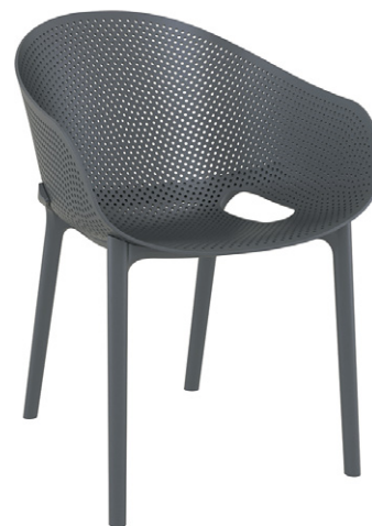
Dark Grey Code: ZA.72108C