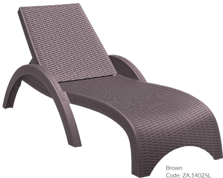
Brown Code: ZA.1402SL