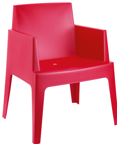
Red Code: ZA.1266C