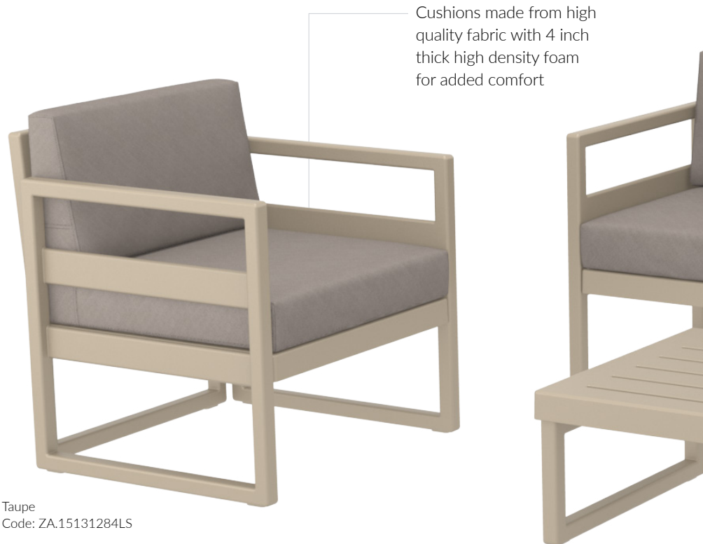
Taupe Code: ZA.15131284LS