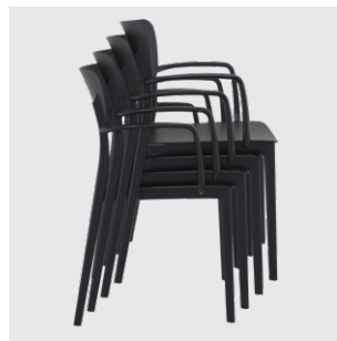
Lisa armchair can stack eight high for easy storage