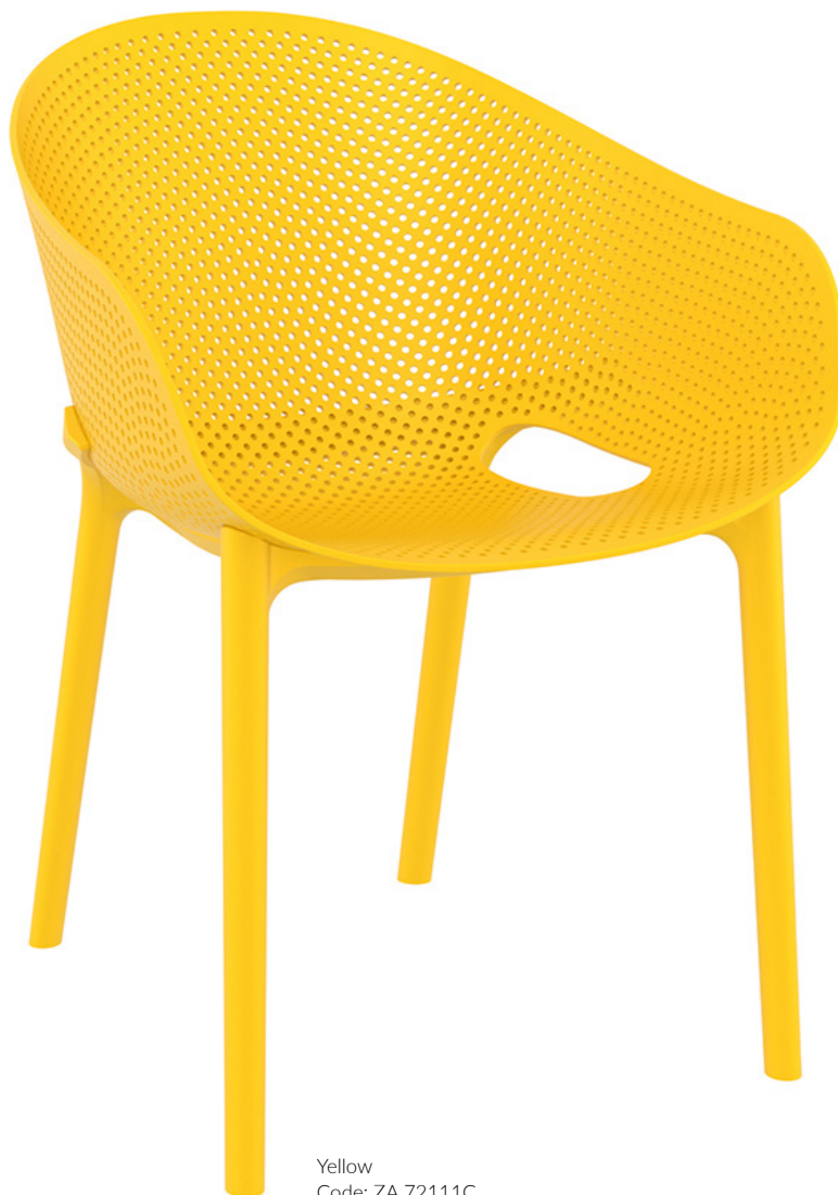
Yellow Code: ZA.72111C