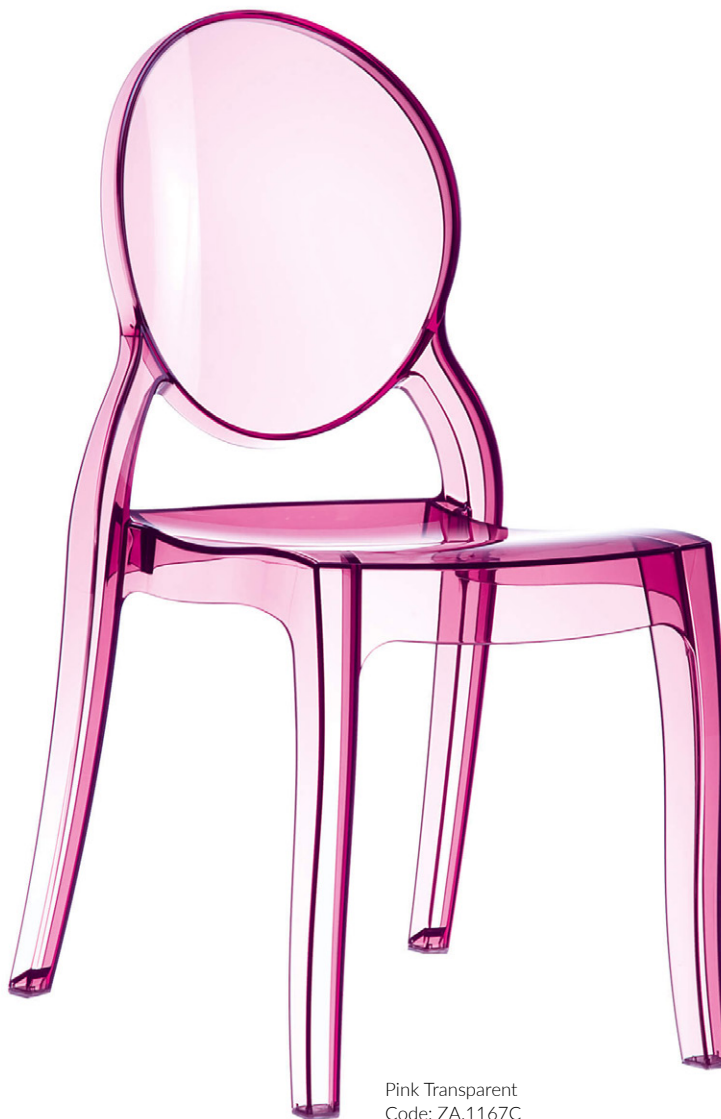
Pink Transparent Code: ZA.1167C