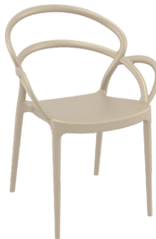
Taupe Code: ZA.1095C