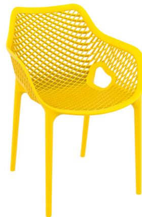
Yellow Code: ZA.478C