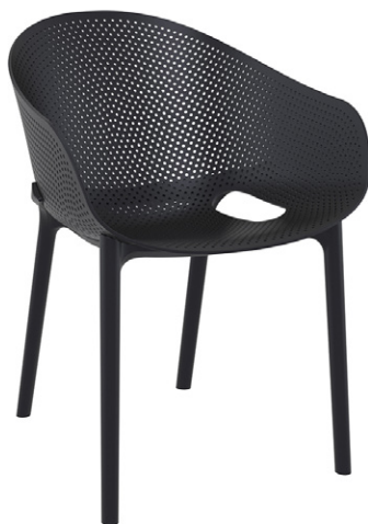
Black Code: ZA.72107C