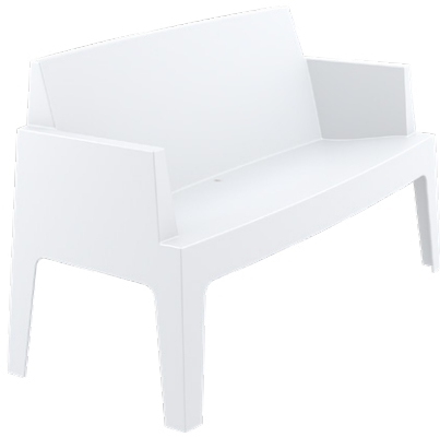
White Code: ZA.1268C