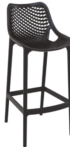
Black Code: ZA.226ST