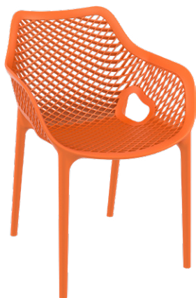
Orange Code: ZA.1474C