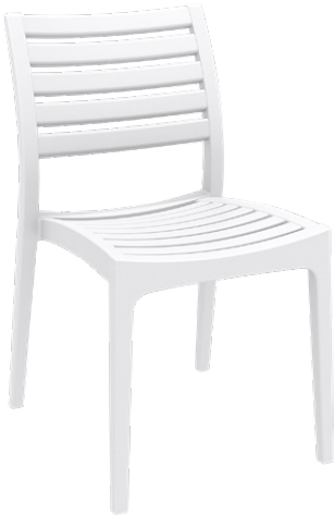
NEW COLOUR - White Code: ZA.15131285C