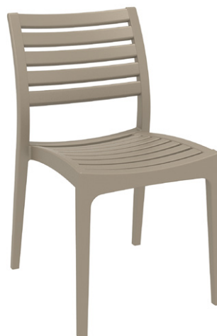
Taupe Code: ZA.1514C