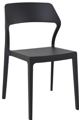
Black Code: ZA.1104C