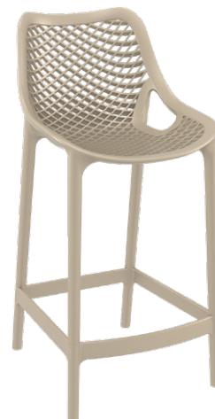
Taupe Code: ZA.1204ST