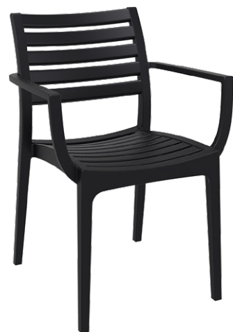
Black Code: ZA.211C