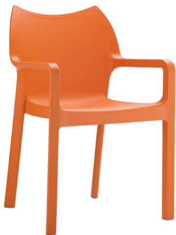
Orange Code: ZA.370C