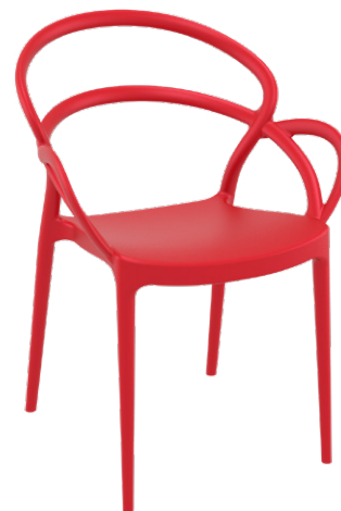
Red Code: ZA.1093C