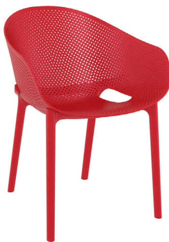
Red Code: ZA.72110C