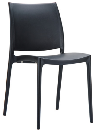
Black Code: ZA.104C