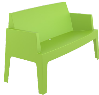
Tropical Green Code: ZA.1275C