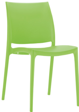
Tropical Green Code: ZA.107C