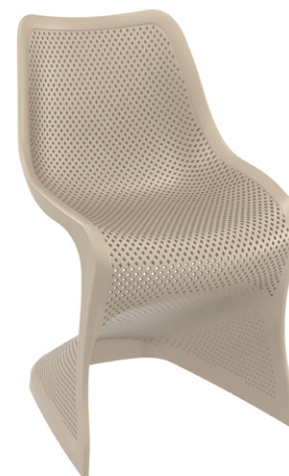
Taupe Code: ZA.1153C