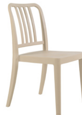
Sand Code: ZA.164C