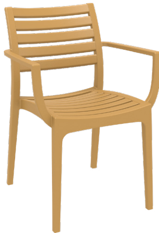
NEW COLOUR - Teak Code: ZA.15131292C