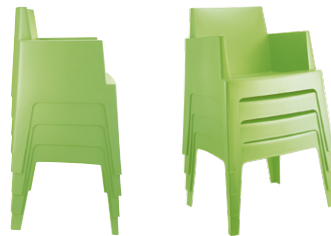
Box armchair can stack 4 high for easy storage