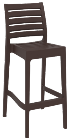
Brown Code: ZA.15131297ST