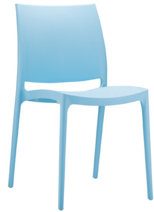
Light Blue Code: ZA.106C