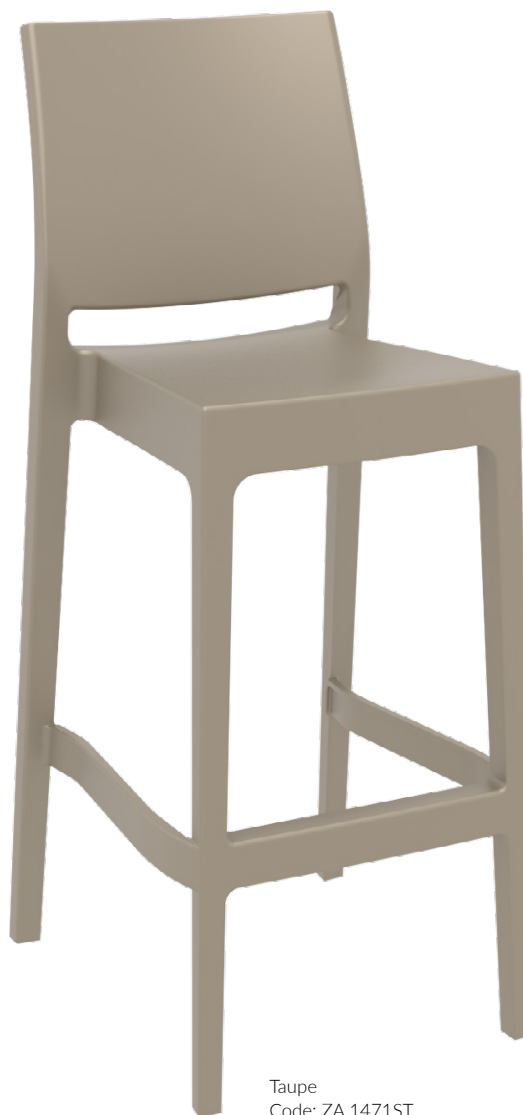
Taupe Code: ZA.1471ST