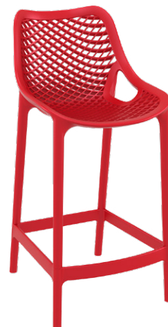
Red Code: ZA.1199ST