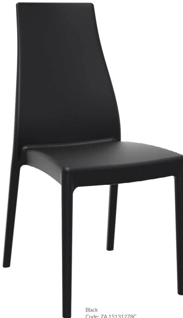
Black Code: ZA.15131278C