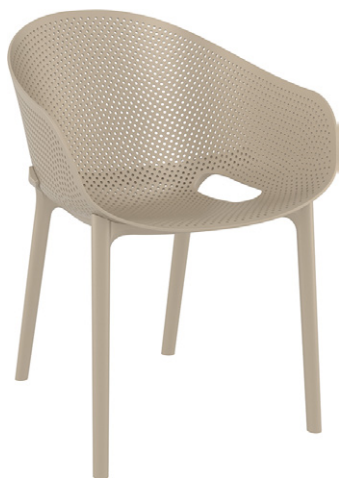
Taupe Code: ZA.72109C