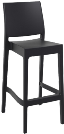
Black Code: ZA.1109ST