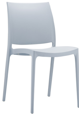
Silver Grey Code: ZA.1478C