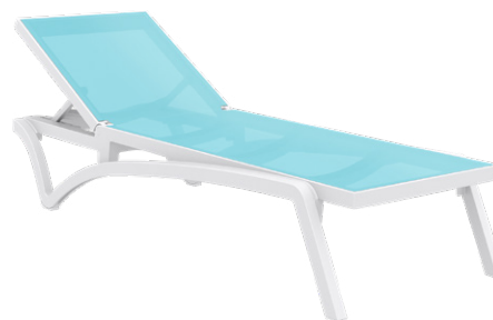
Turquoise/White Code: ZA.1396SL