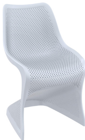
Silver Grey Code: ZA.1148C