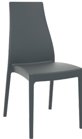
Dark Grey Code: ZA.15131276C