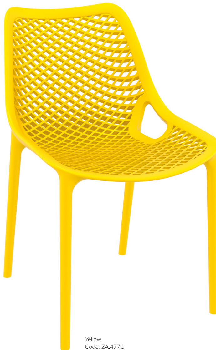
Yellow Code: ZA.477C