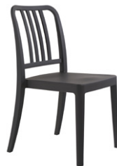
Anthracite Code: ZA.160C