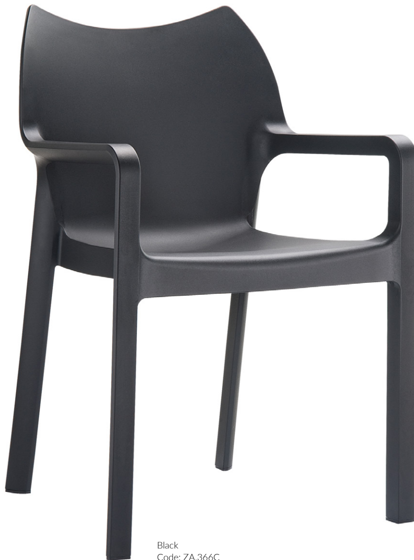
Black Code: ZA.366C