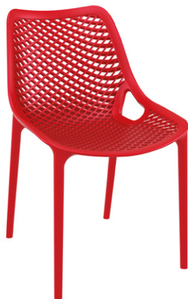
Red Code: ZA.216C