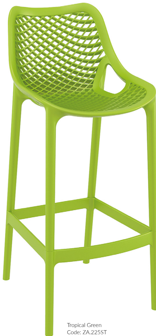
Tropical Green Code: ZA.225ST