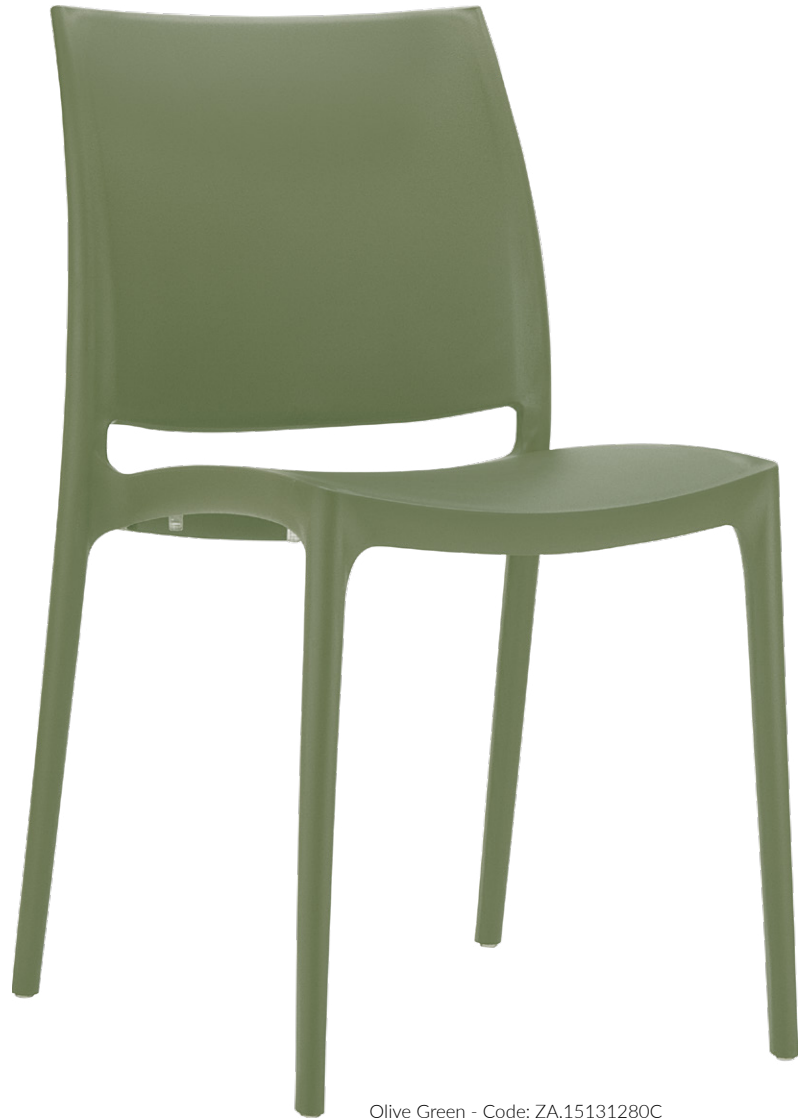
Olive Green - Code: ZA.15131280C