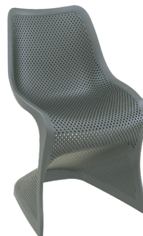
Dark Grey Code: ZA.1149C