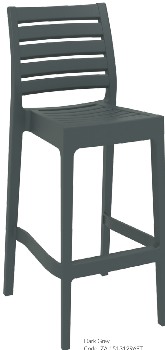
Dark Grey Code: ZA.15131296ST