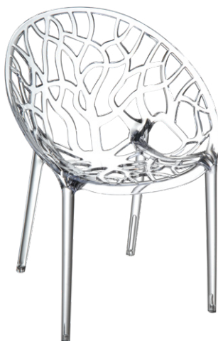
Clear Transparent Code: ZA.1161C