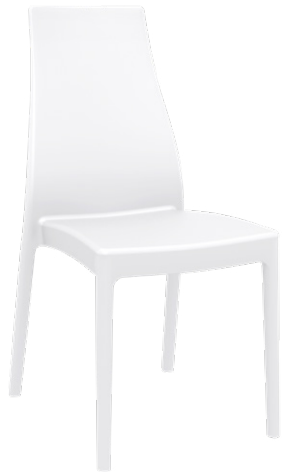
White Code: ZA.15131275C