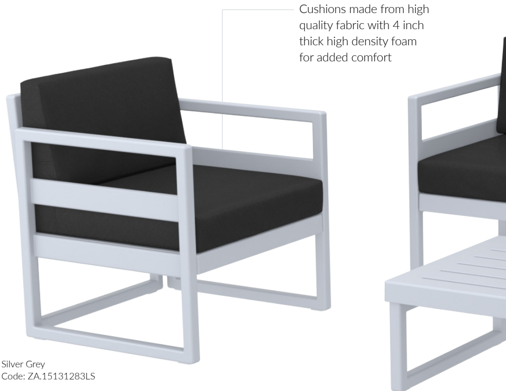
Silver Grey Code: ZA.15131283LS