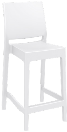
White Code: ZA.1111ST