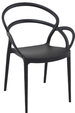
Black Code: ZA.1094C