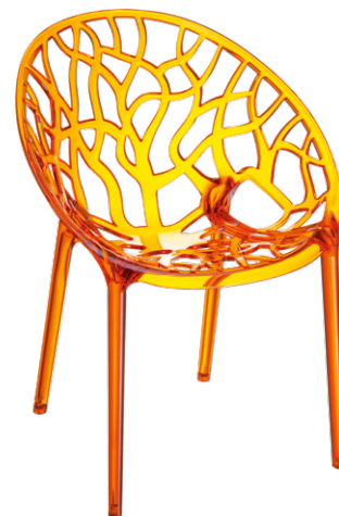
Orange Transparent Code: ZA.1162C