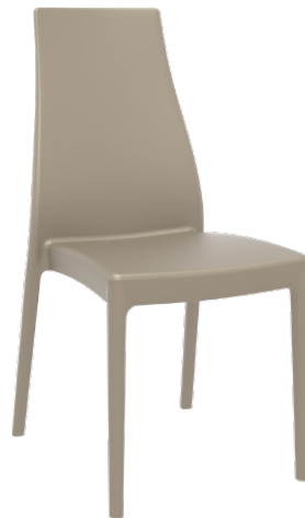
Taupe Code: ZA.15131279C