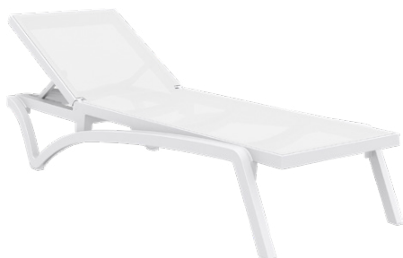
White/White Code: ZA.1397SL