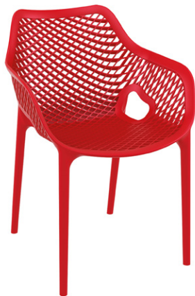
Red Code: ZA.220C