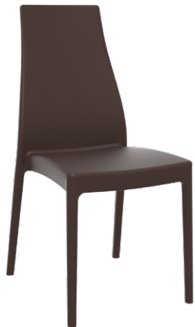
Brown Code: ZA.15131277C