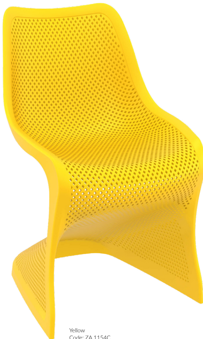
Yellow Code: ZA.1154C