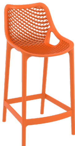
Orange Code: ZA.1203ST