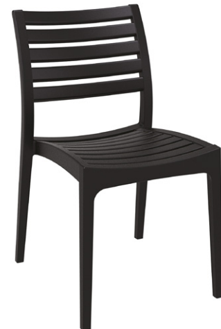
Black Code: ZA.213C