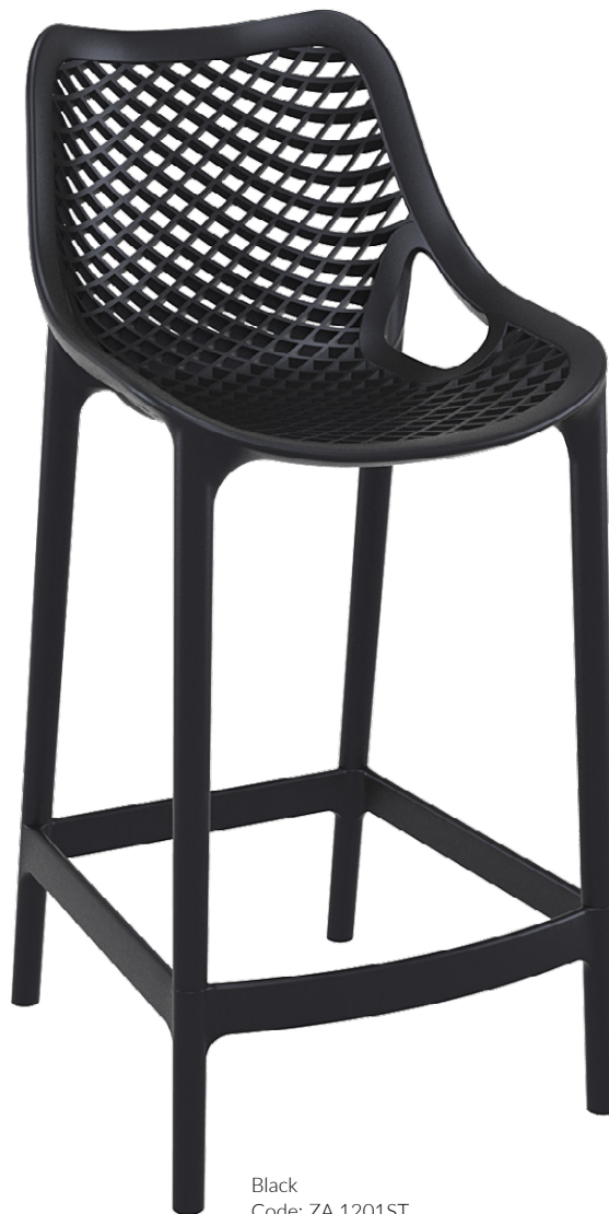
Black Code: ZA.1201ST