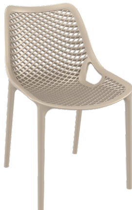
Taupe Code: ZA.1473C