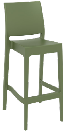
Olive Green Code: ZA.15131281ST