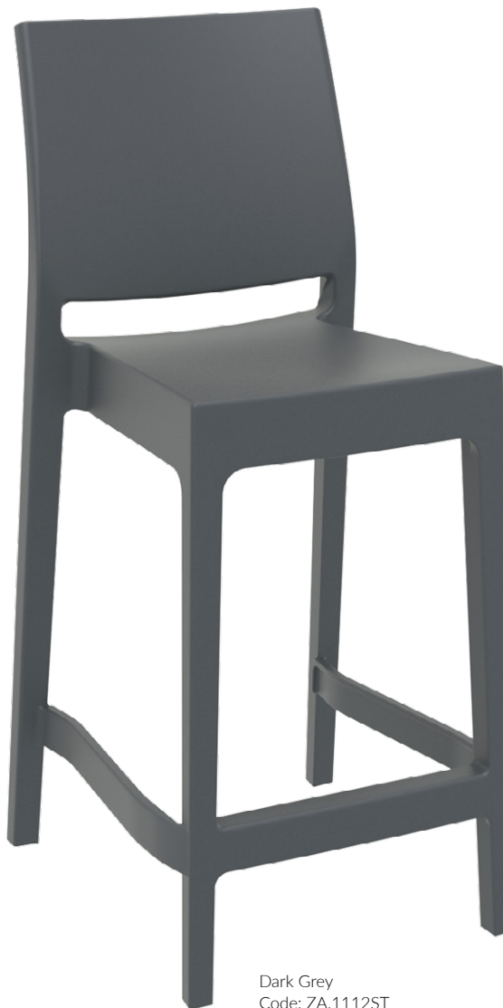
Dark Grey Code: ZA.1112ST