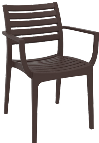
NEW COLOUR - Brown Code: ZA.15131294C