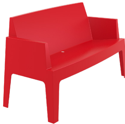
Red Code: ZA.1274C