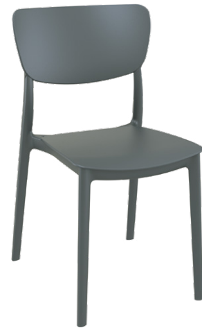
Dark Grey Code: ZA.15115C