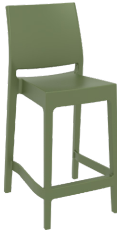
Olive Green Code: ZA.15131280ST