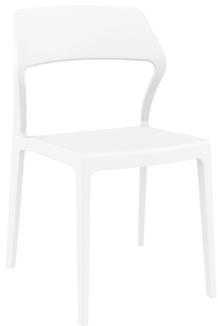
White Code: ZA.1101C