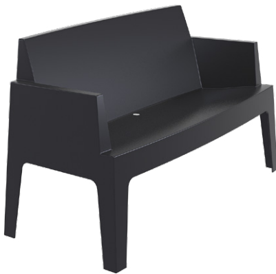
Black Code: ZA.1273C