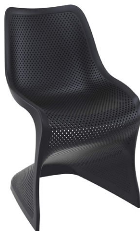
Black Code: ZA.1152C