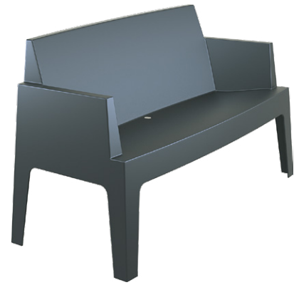
Dark Grey Code: ZA.1271C