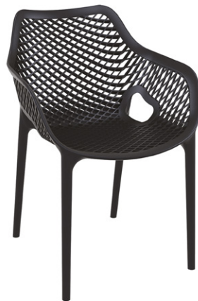
Black Code: ZA.222C