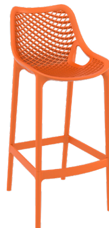
Orange Code: ZA.1476ST