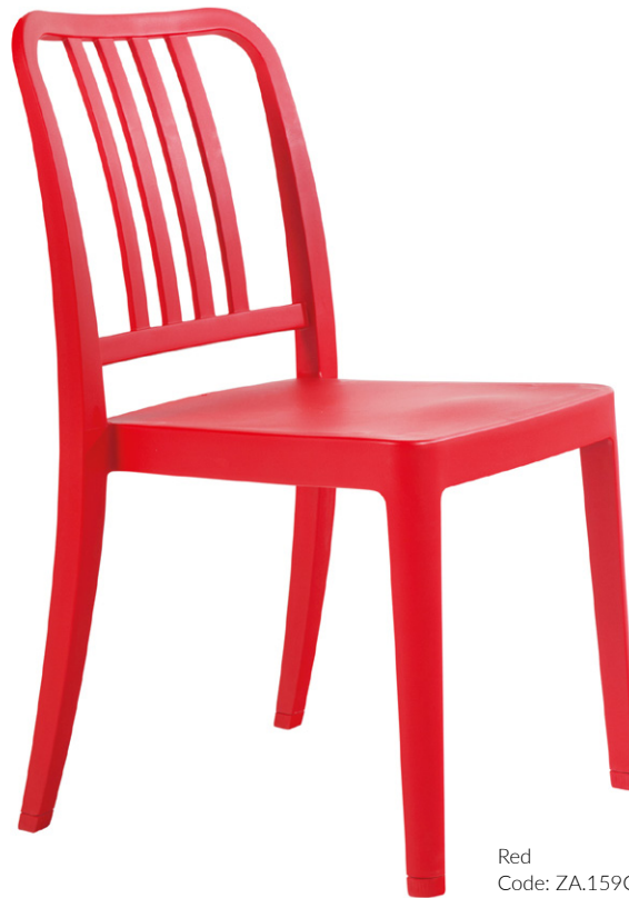
Red Code: ZA.159C