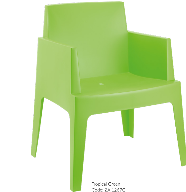
Tropical Green Code: ZA.1267C