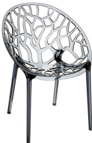
Smoke Grey Transparent Code: ZA.1156C