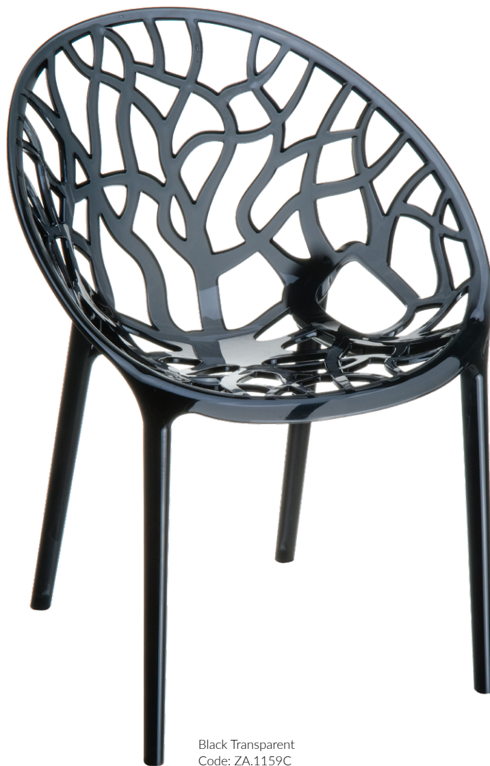
Black Transparent Code: ZA.1159C