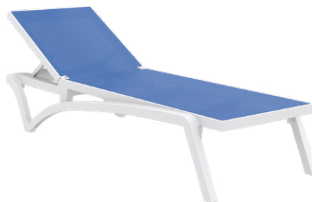
Blue/White Code: ZA.1394SL