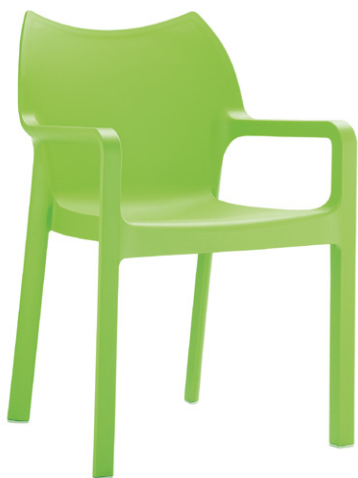
Tropical Green Code: ZA.369C