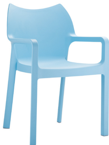
Light Blue Code: ZA.368C