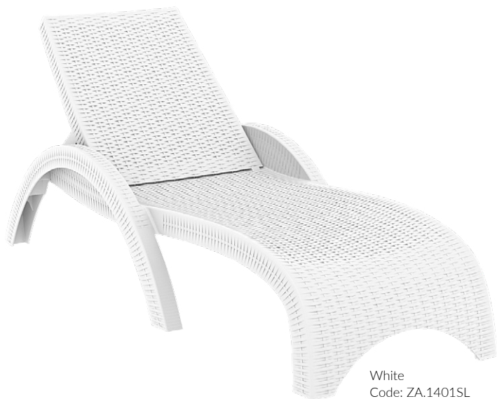
White Code: ZA.1401SL