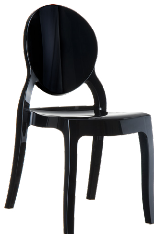
Glossy Black Code: ZA.1166C