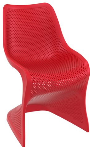
Red Code: ZA.1151C