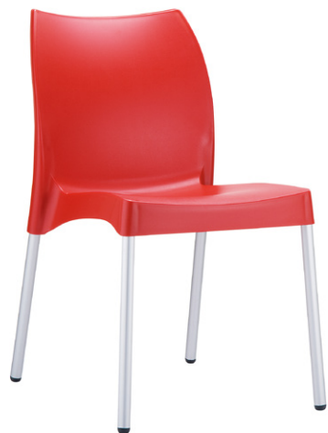
Red Code: ZA.475C