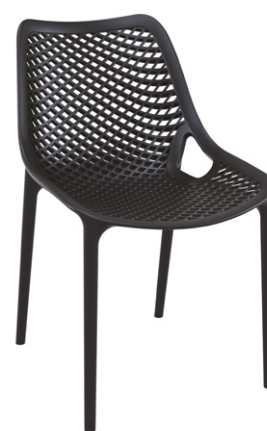
Black Code: ZA.218C