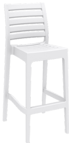
White Code: ZA.15131295ST