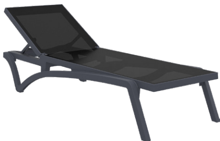
Black/Dark Grey Code: ZA.1393SL