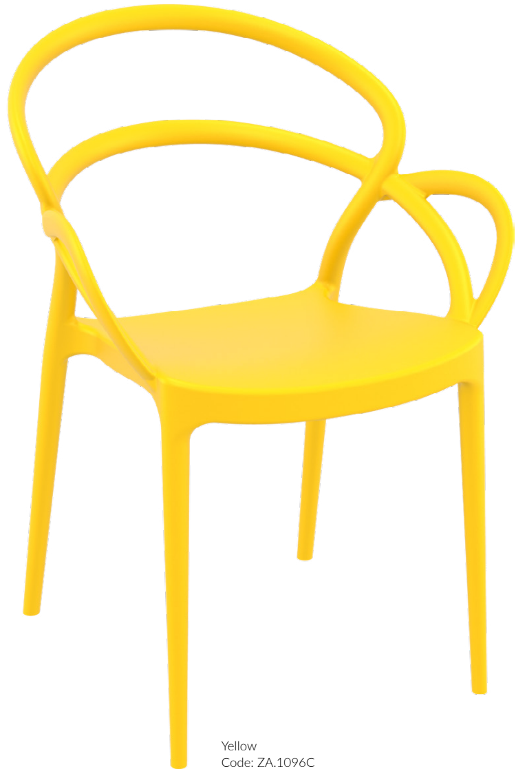
Yellow Code: ZA.1096C