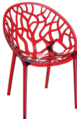
Red Transparent Code: ZA.1157C