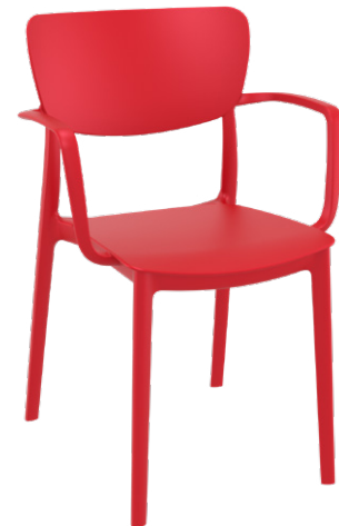
NEW COLOUR Red - Code: ZA.7152C