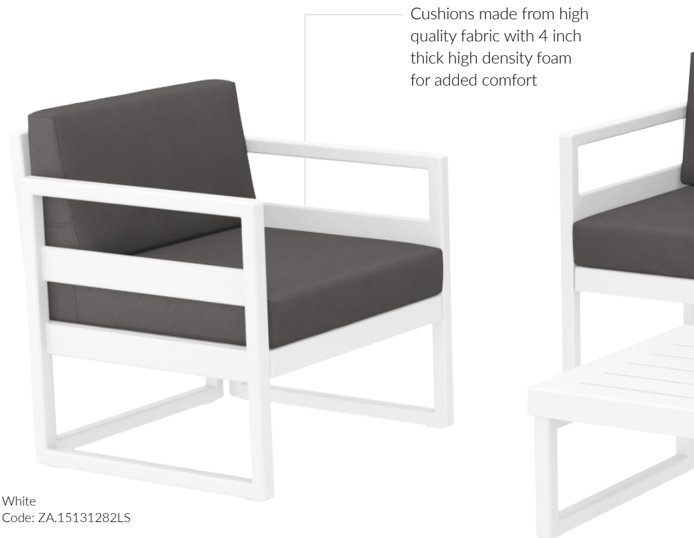
White Code: ZA.15131282LS