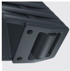
Comes with hidden wheels and anti-slippery rubbers