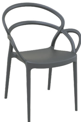
Dark Grey Code: ZA.1092C