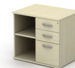
combination open unit