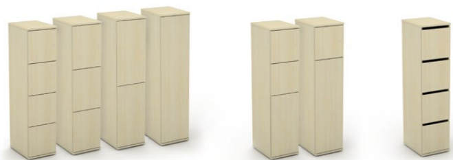
personal lockers available with various door options

(choice of 2, 3, 4 or a single door option)