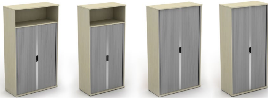
1200mm & 1000mm wide open tambour units

(available as 2062mm, 1657mm, 1252mm, 847mm & 725mm high)