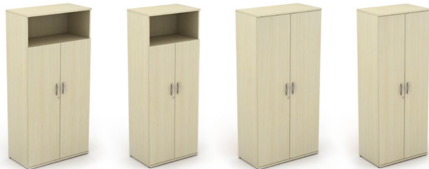
1000mm & 800mm wide open cupboards

(available as 2062mm, 1657mm, 1252mm, 847mm & 725mm high with a choice of handle)