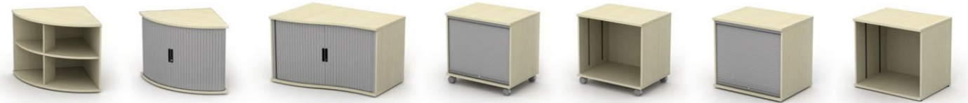
radial end open storage