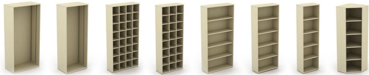
1000mm & 800mm wide open units