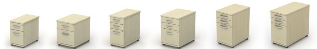
narrow mobile pedestals