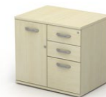
combination cupboard unit