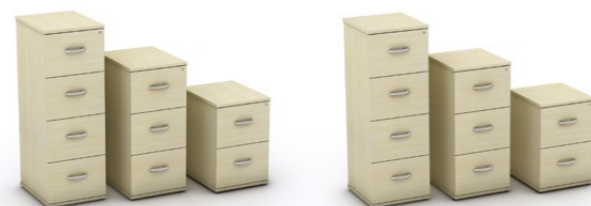
600mm deep filing cabinets (4, 3 or 2 drawers)