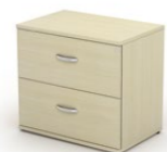
525mm & 600mm deep side filers