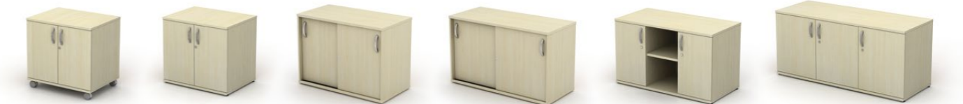
600mm deep mobile cupboard